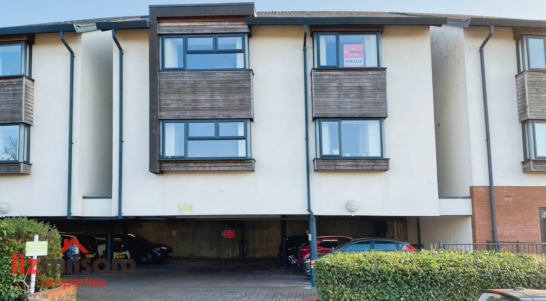
Apartment 211 Oakland Village Swadlincote, DE11 8ND £172,500